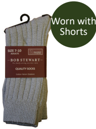
Socks short walk 2pk