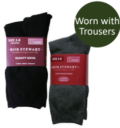
Socks Crew 3pk