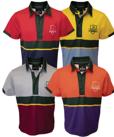
House Polo Junior Assorted House Colours