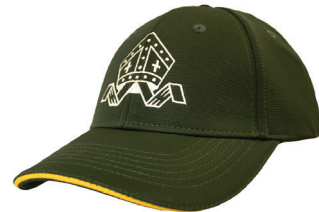
Cap - Green or White