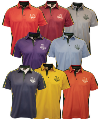
House Polo Senior Assorted House Colours