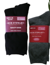
Socks Crew 3pk