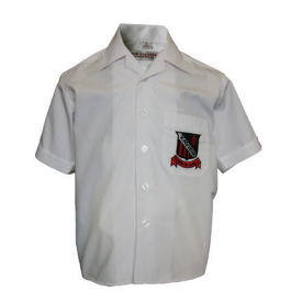
Shirt Crest Short Sleeve