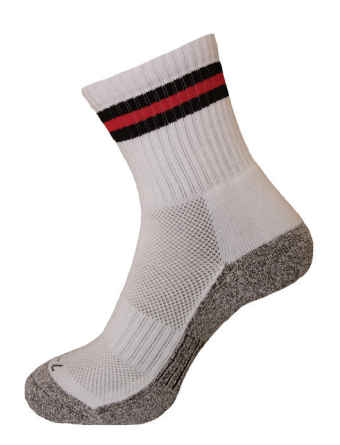
Sports Sock 2pk