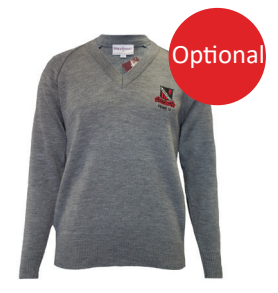
Year 12 Pullover