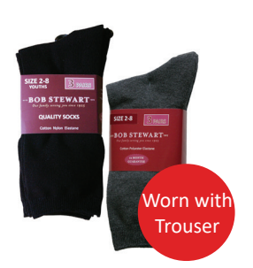
Socks Crew Blk or Grey