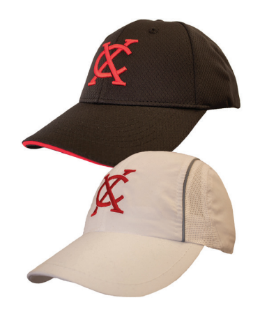
Sports Caps - Black or White