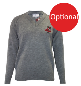
Year 12 Pullover