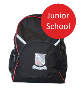
Uno School Backpack