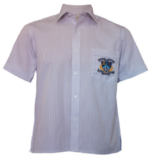
Male Shirt Short Slv