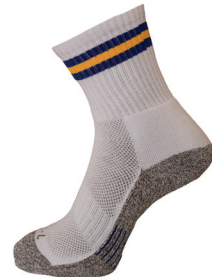
Sports Socks 2pkt