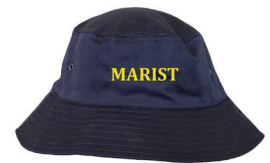
Year 12 Bucket Hat