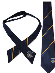
Year 12 Ties