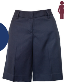
Female Tailored Shorts