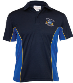
Polo Top Short Sleeve