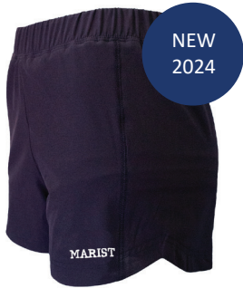
Sports Short with Inner