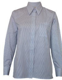
Blouse Long Sleeve