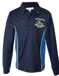
Sports Polo - Long Slv