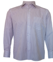
Shirt Long Sleeve