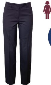
Female Tailored Pants