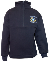
Polar Fleece Top