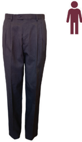
Trouser Pleat front Grey