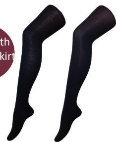
Tights Opaque / Bamboo Navy

For current prices, please refer to www.bobstewart.com.au