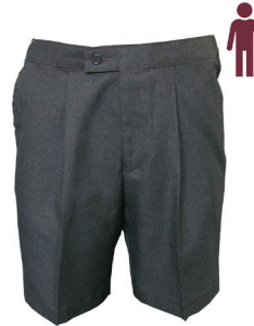
Senior Shorts Belt Loop