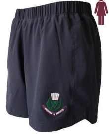
Sport Shorts with Inner