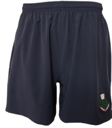
Sport Shorts Unisex