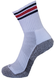
Sports Sock 2 pkt