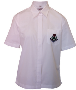
Short Sleeve Blouse