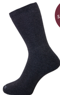
Sock Grey 3 Pkt