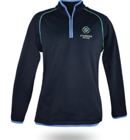
1/4 Zip Top