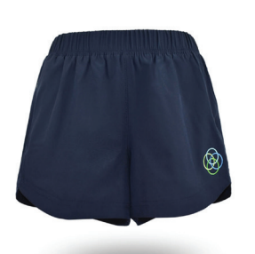
Sport Short with Inner