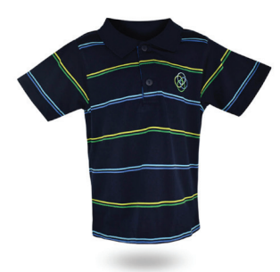
Striped Polo Top