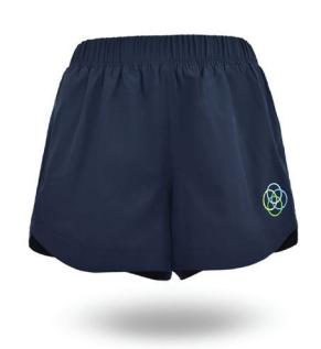
Sport Shorts with Inner