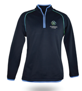
1/4 Zip Top