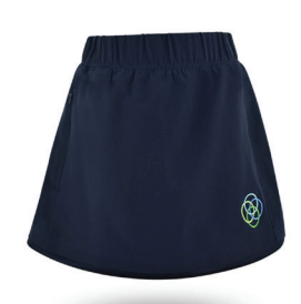
Skort - Navy