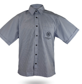
Relaxed Shirt Short Sleeve