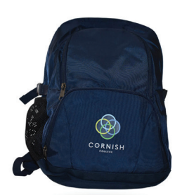
Senior Back Pack