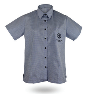
Tailored Shirt Short Sleeve