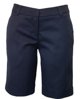
Shorts - Tailored Navy