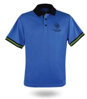
Polo Short Sleeve