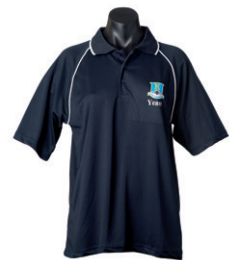
year 9 polo