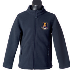
polar fleece jacket