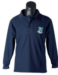
long sleeve polo