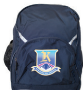
school bag Junior