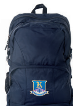
school bag senior