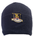
beanie (ELC to year 12)