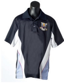
short sleeve polo