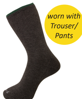
Sock Crew Grey 3pkt