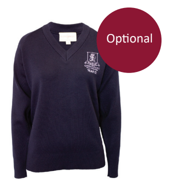
Year 12 Pullover