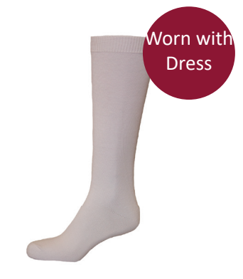
Sock Kneehigh 2 pkt