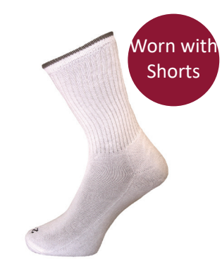
Sock Crew with trim