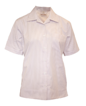
Blouse Short Sleeve