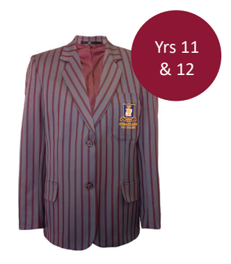
Blazer Yrs 11 & 12