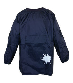
Art Smock Navy