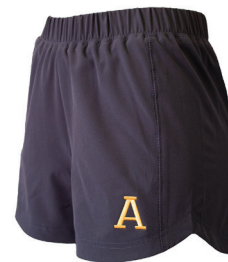
Sport Short Girls