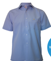
Shirt Short Sleeve