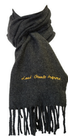
Scarf with emb