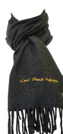
Scarf with emb