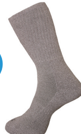
Socks Walk Grey 2pkt