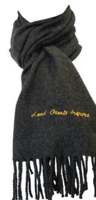
Scarf with emb