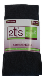
Tights Dk Grey Cotton