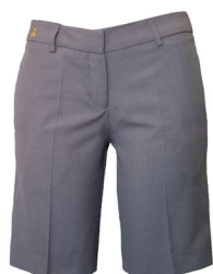
Shorts Tailored Silver Grey