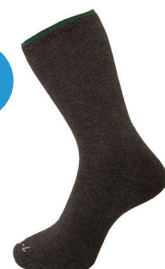
Sock Crew Grey 3 pkt

For current prices, please refer to www.bobstewart.com.au