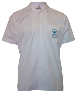
Short Sleeve Shirt with crest