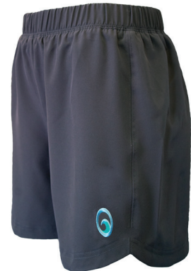
Sports Short with Inner