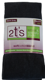
Tights Dark Grey