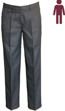
Trousers Grey Melange