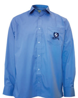
Shirt Long Sleeve Year 7 to 9