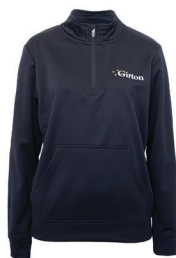
Polar Fleece Top