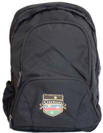
Airopak - 3 sizes