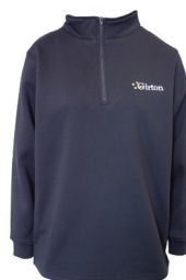
1/4 Zip Fleece Top