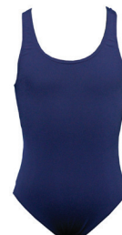
Bathers One Piece

For current prices, please refer to www.bobstewart.com.au