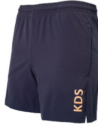
Sport Shorts regular fit