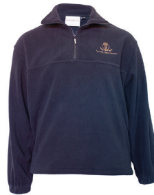
Polar Fleece Top