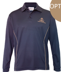
Polo Long Sleeve