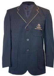
Blazer - Yrs 10 - 12