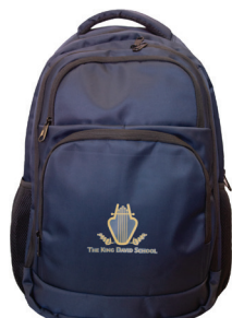
School Backpack Yr3 - 12