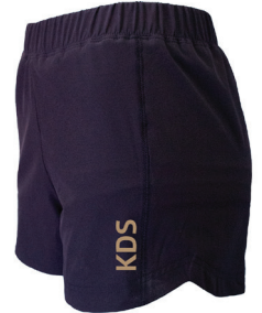
Sport Shorts with Inner