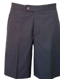
Shorts Senior fly front