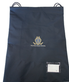
Library Bag Prep-Yr2