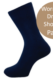
Socks Navy 3 pk