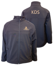
Softshell Jacket - Prep to 9