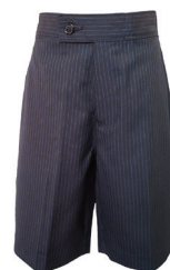
Shorts elastic back