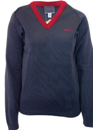
Pullover Yr 12