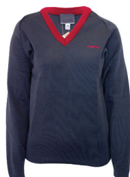
Pullover Yr 12