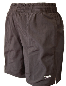
Swim Shorts Black