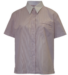
Blouse Short Sleeve