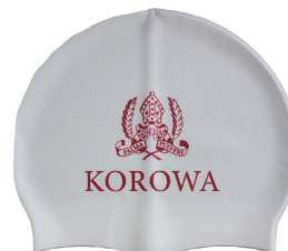
Squad Swim Cap