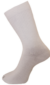
Socks Anklet 2 pkt