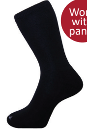
Sock Crew 3 pk