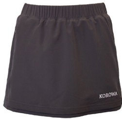
Sport Skort - Netball Junior