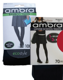
Tights Black cotton/opaque