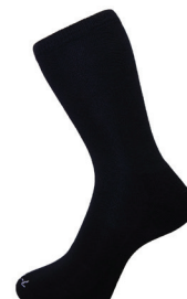
Sock Crew 3 pk