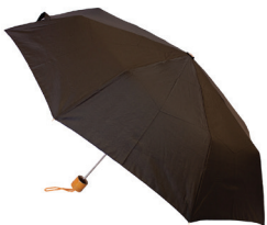
Umbrella Compact Black