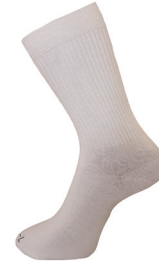
Socks Anklet 2 pkt