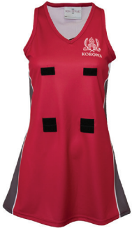
Netball Dress - from Yr5