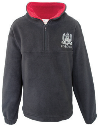
Qtr Zip Fleece Top