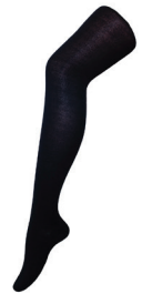
Tights Cotton Navy