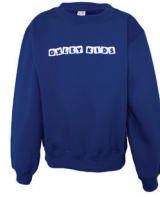
Oxley Kids Windcheater