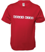
Oxley Kids T Shirt