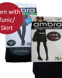
Tights Navy or Black