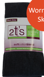
Tights Dark Grey