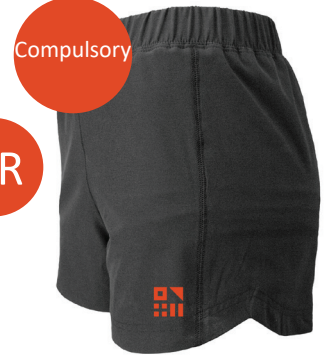
Sport Shorts with Inner