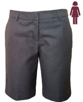
Tailored Shorts Dark Grey