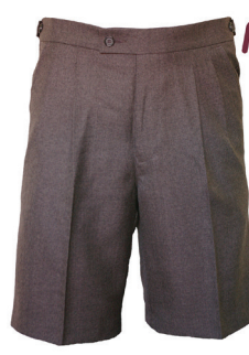
Shorts pleat front Pinhead Grey