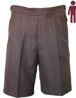
Shorts pleat front Pinhead Grey