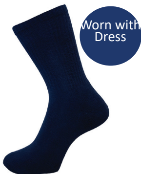
Socks Navy 3pkt