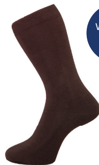
Socks Grey 3 Pkt