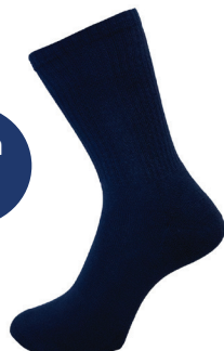
Socks Navy 3pkt