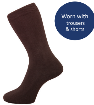
Socks Grey 3 Pkt