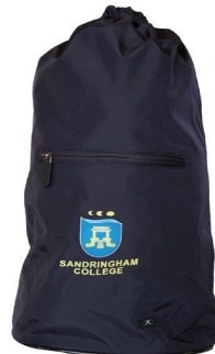
Soft Sports Bag