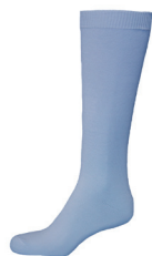
Knee High Socks