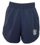
Junior Sport Short