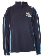
1/4 Zip Top