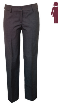
Pants Tailored Pinhead