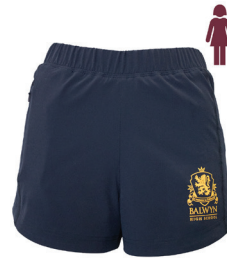
Sports Short with inner