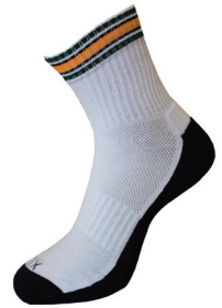
Sports Socks 2pkt