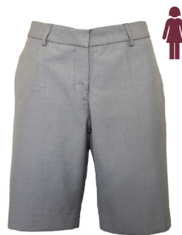
Shorts Tailored Silver Grey