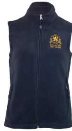
Polar Fleece Vest