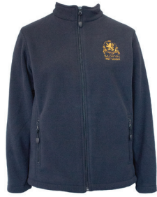
Polar Fleece Jacket