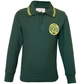
Polo Long Sleeve Bottle