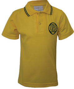
Polo Short Sleeve Gold