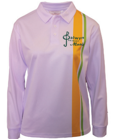
Shorts Gabardine Pull On Shorts Knit Elastic waist Music Polo Long Sleeve