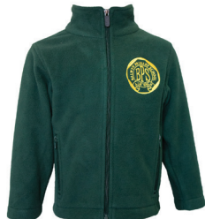
Polar Fleece Jacket