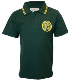
Polo Short Sleeve Bottle