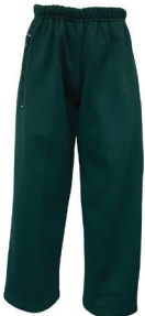
Trackpant Straight Leg