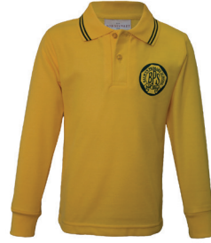
Polo Long Sleeve Gold