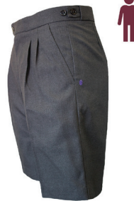
Shorts Senior with crest