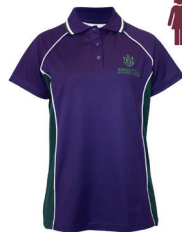
Polo Girls fit