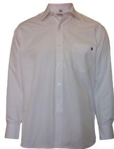
Shirt with crest