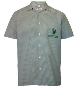
Shirt Stripe Short Sleeve