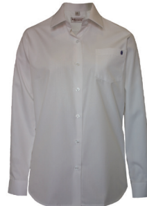
Blouse with crest