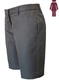
Shorts Tailored with crest