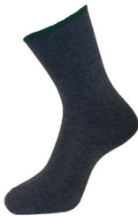
Socks Grey 2 pkt with green tipping