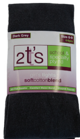
Tights Dark Grey Cotton