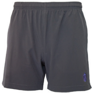
Sport Shorts Unisex