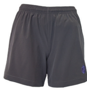
Sports Short Girls