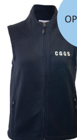
Polar Fleece Vest