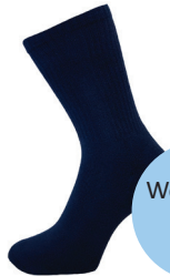
Socks Navy Crew 3pk