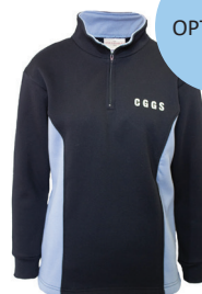
Top Qtr Zip