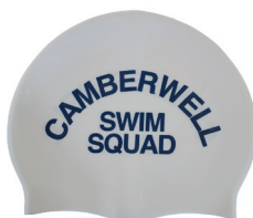
Swim Cap Squad