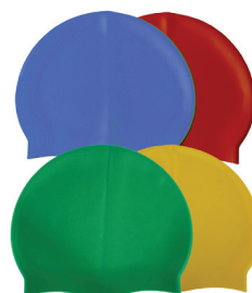
Swim Cap House

For current prices, please refer to www.bobstewart.com.au