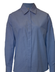
Blouse Long Sleeve