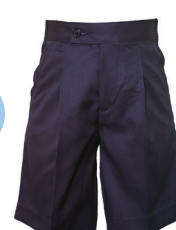
Shorts elastic back