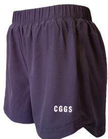
Sports Short with Inner