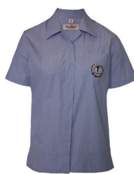
Short sleeve Blouse