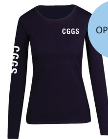
Long Sleeve Tee