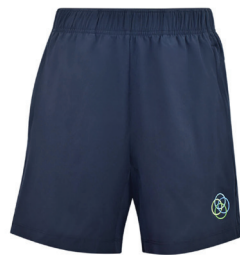
Sport Short Navy