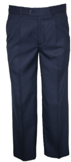
Trousers - Senior Navy