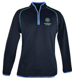
1/4 Zip Top