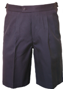
Shorts - Senior Navy