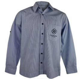
Relaxed Shirt Long Sleeve