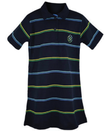
Striped Polo Dress