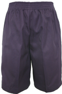
Shorts Elastic waist Navy