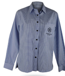
Tailored Shirt Long Sleeve