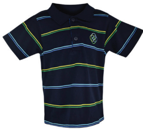
Striped Polo Top