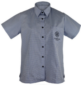
Tailored Shirt Short Sleeve