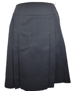
Skirt Pleated - Navy