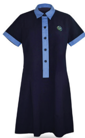
Dress - Navy