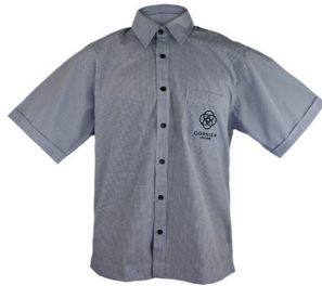
Relaxed Shirt Short Sleeve