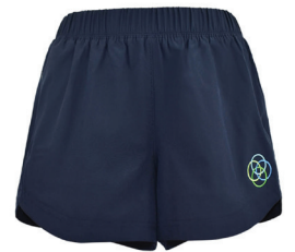
Sport Shorts with Inner