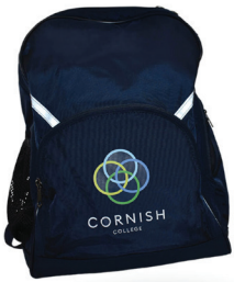
Junior Back Pack