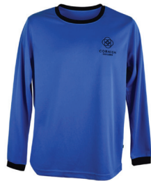
Crew Top Long Sleeve