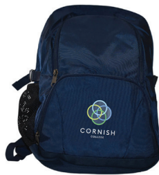
Senior Back Pack