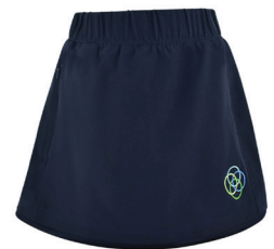
Skort - Navy