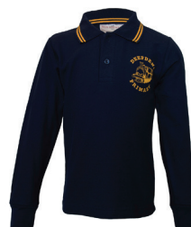
Polo Long Sleeve