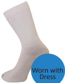
Socks Anklet 2pk