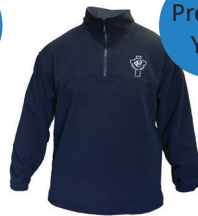
Polar Fleece 1/4 Zip Top