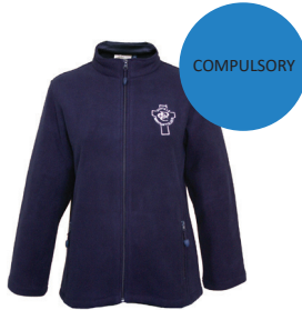
Polar Fleece Jacket Full Zip