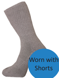
Short Walk Socks 2pk Grey Marle