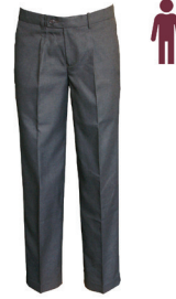
Trousers Grey Melange