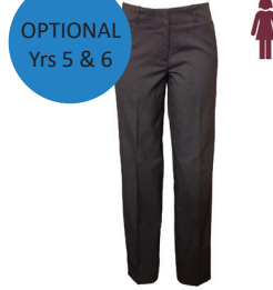
Pants Tailored Grey Melange