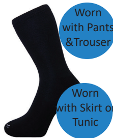
Socks Crew Black 3 pk