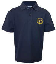
ELC Polo Top