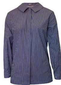
Blouse Long Sleeve