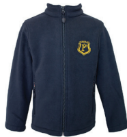
Polar Fleece Jacket