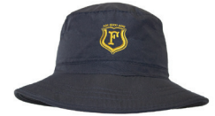
Hybrid Bucket Hat