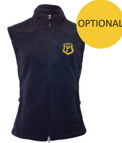
Polar Fleece Vest