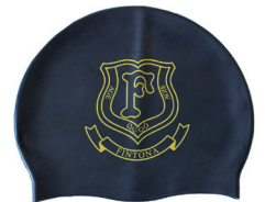
Swimming Cap Squad