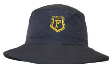
Hybrid Bucket Hat