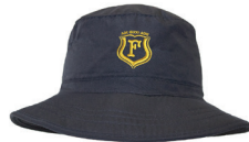
Hybrid Bucket Hat