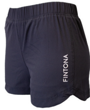
Sport Shorts with inner