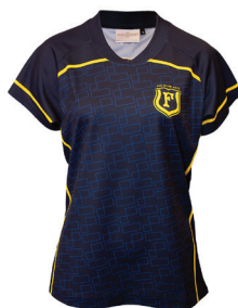
Multi Purpose Top