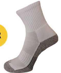
Socks Sport 2pkt