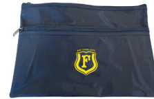
Document Wallet / Pencil Case