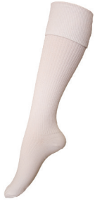
Socks Kneehigh 2pk