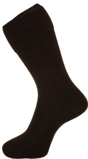
Socks Black 3 pk