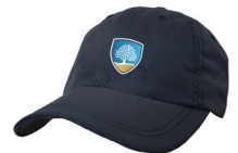
Senior Cap Compulsory Terms 1 & 4