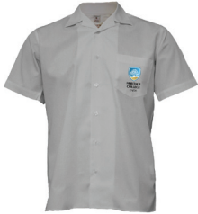
Shirt Short Sleeve with Crest