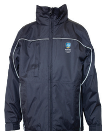
Coat with Crest (Optional outdoor only Prep - Yr 6)

For current prices, please refer to www.bobstewart.com.au