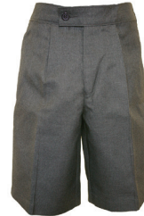
Dark Grey Shorts Primary fly front with elastic back