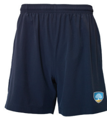
Navy Sport Shorts with crest