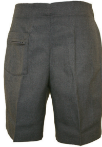
Dark Grey Shorts Primary pull on with elastic back