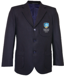
Heritage Blazer Compulsory all Year