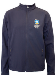
Soft Shell Jacket - Sports Compulsory Terms 2&3 for interschool events