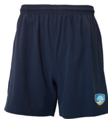
Navy Sport Shorts with crest