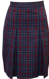
Winter Skirt Years 5-6