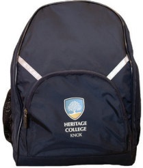
Uno Schoolbag Compulsory