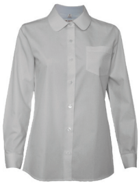
Peter Pan Blouse worn with Tunic Only Prep - Yr 4