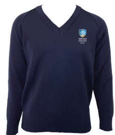
Pullover with crest Optional All Year