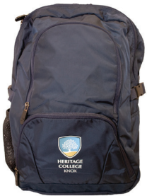
Airopak Schoolbag Compulsory