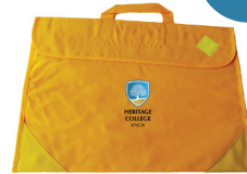
Library Bag Compulsory