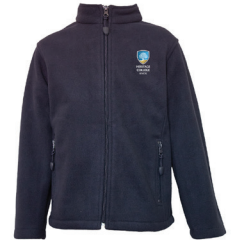
Polar Fleece Jacket (All Year Item)