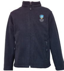
Polar Fleece Jacket (All Year Item)