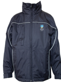
Coat with Crest (Optional outdoor only Prep - Yr 6)