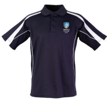
Sports Polo Short Sleeve