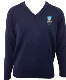
Pullover with crest Optional All Year