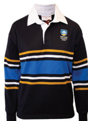
Rugby Jumper Optional for Sports

For current prices, please refer to www.bobstewart.com.au