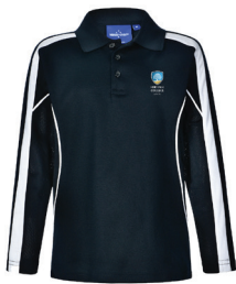
Sports Polo Long Sleeve