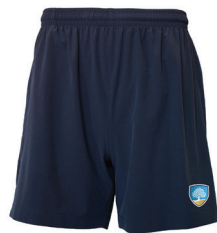
Navy Sport Shorts with crest