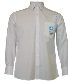
Shirt Long Sleeve with Crest - with skirt only