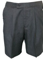
Dark Grey Senior Shorts