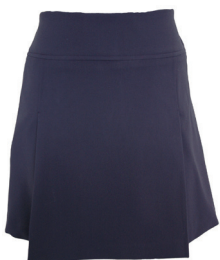
Navy Skort Optional Prep - Yr6 Sport