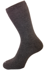
Grey Crew Sock All year academic uniform