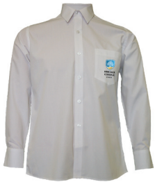
Shirt Long Sleeve with Crest