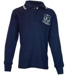
Polo Navy Long Slv