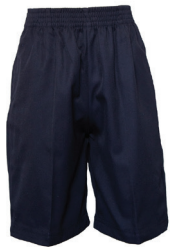
Shorts Pullon Gaberdine Navy