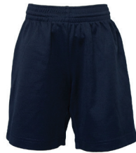
Sport Shorts Navy