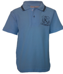
Polo Sky Short Slv