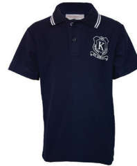
Polo Navy Short Slv