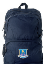
school bag senior