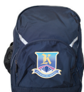
school bag Junior