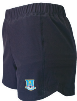
sport shorts (with inner)