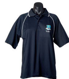
year 9 polo