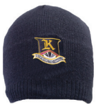
beanie (ELC to year 12)