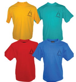
House T Shirt Gold