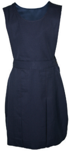
Winter Tunic Navy