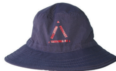
Hat with crest