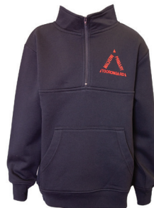
Qtr Zip Top