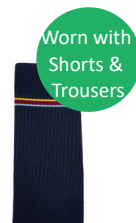
Socks with Stripe 2pkt