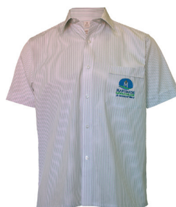
Short Sleeve Shirt