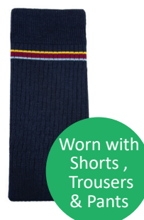
Sock Stripe Navy 2pkt