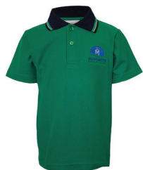
Sports Polo Top Jnr