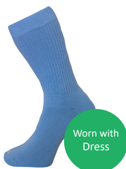
Anklet Sock Sky blue 2 pkt