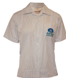
Blouse Short Sleeve