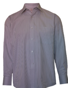
Shirt Long Sleeve