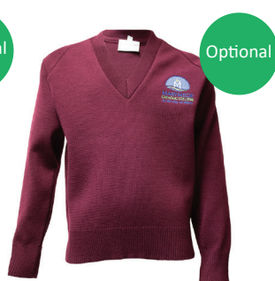
Pullover Maroon VCE