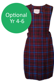
Optional Yr 4-6