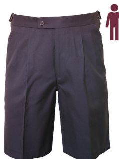
Shorts Senior Navy