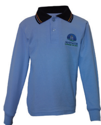
Polo Top Long Sleeve