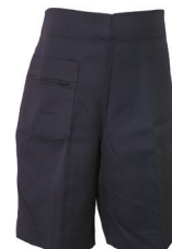
Shorts Pull on elastic back Navy