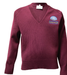
Pullover Maroon VCE