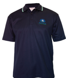
Sports Polo Top