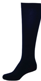
Socks Kneehigh 2pk