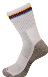
Sports Sock 2 pkt