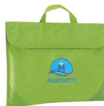
Prep Reader Bag