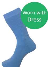
Anklet Sock Sky blue 2 pkt