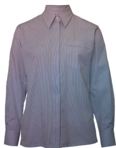
Blouse Long Sleeve