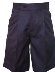
Shorts fly front, elastic back, Navy