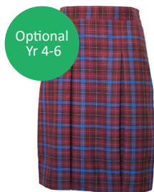
Optional Yr 4-6