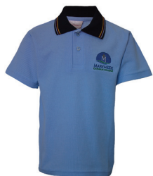
Polo Short Sleeve