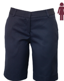
Shorts Tailored Navy