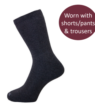
Sock Grey 3 Pkt