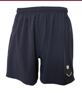
Sport Shorts Unisex