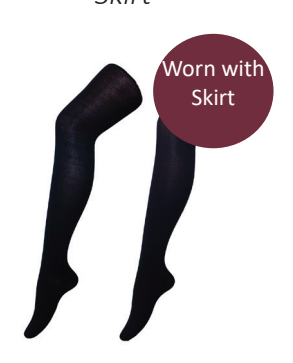
Tights Opaque / Bamboo Navy

For current prices, please refer to www.bobstewart.com.au