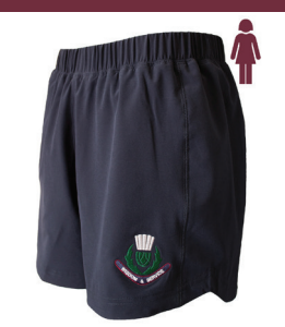
Sport Shorts with Inner