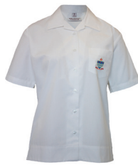
Blouse Short sleeve