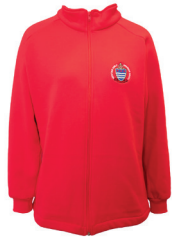
Fleecy Track Top