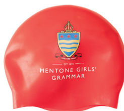
Swim Cap - school