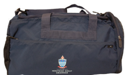
Sports Bag - Yr7-12