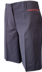
Shorts with embroidery