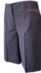
Shorts with embroidery