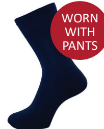
Crew Sock Navy 3pk