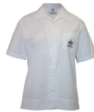
Blouse Short Sleeve