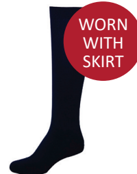
Sock Knee High Navy