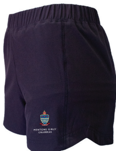
Sport Shorts w/inner