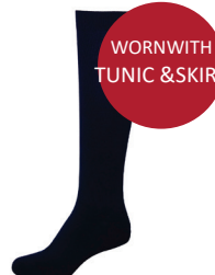
Sock Knee High Navy