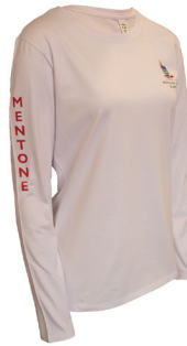
Long Sleeve Tee