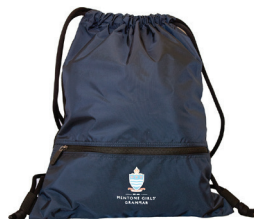
Gearsack - Prep - 6