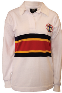
Rugby Top from Year 5