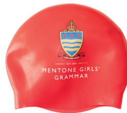
Swim Cap - school