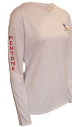
Long Sleeve Top