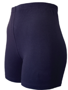
Bike Shorts - worn under dress