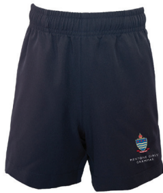
Junior Sport Shorts