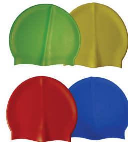
House Swim Cap