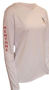
Long Sleeve Tee