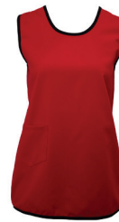
Apron - Prep Only