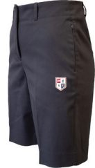
Shorts Tailored Navy