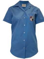
Short Sleeve Blouse