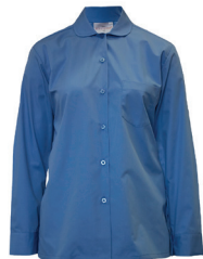
Blouse Long Sleeve