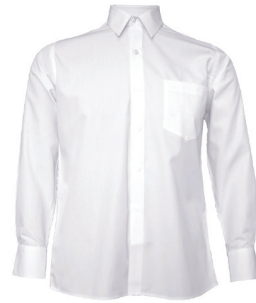
Long sleeve Shirt