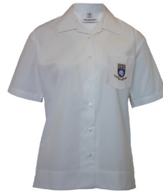
Short sleeve Blouse