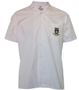
Short sleeve Shirt