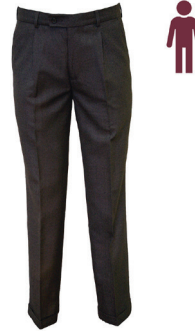
Trouser Wool Blend Pinhead