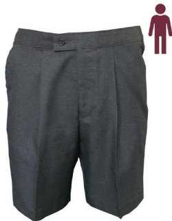
Senior Shorts Drk Grey