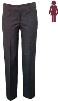
Tailored Pant Wool Blend Pinhead