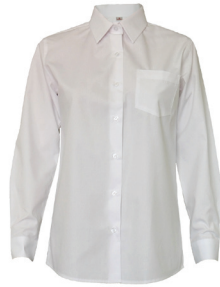
Long sleeve Blouse