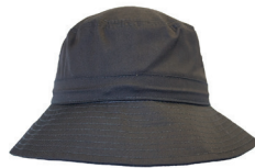
Bucket Hat Navy