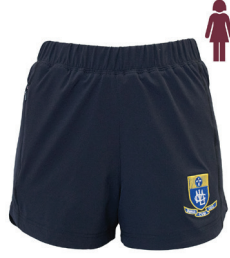
Sport Shorts with inner