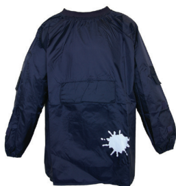
Art Smock Navy