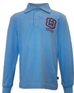
Polo long sleeve