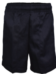
Elastic Waist Shorts