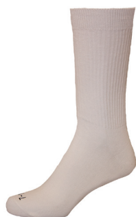
Socks Anklet White 2pkt