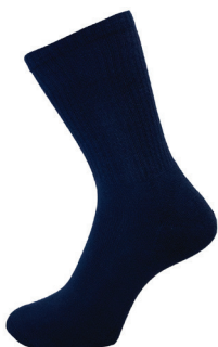
Socks Crew Navy 3pkt