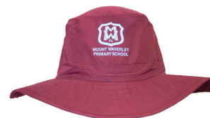
Hybrid Bucket Hat