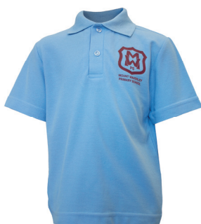
Polo short sleeve