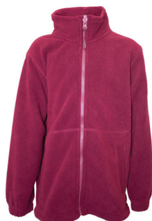
Polar Fleece Jacket