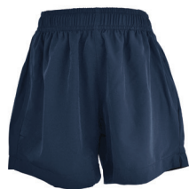
Sport Shorts Microfibre