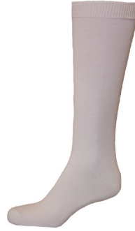
Kneehigh Cotton Rich