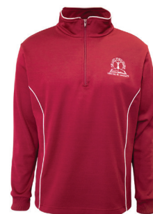
Qtr Zip Top