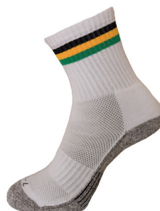
Sock 2 pk Stripe