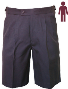
Shorts Pleated Front Navy