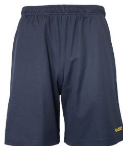
Sport Short - Long