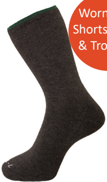
Socks Crew Grey 3pkt