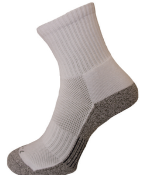
Socks Sport 2 pkt Plain, no logos