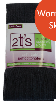
Tights Dark Grey