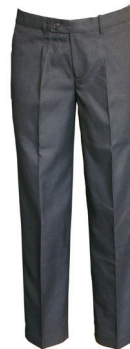
Trousers Pleat Front Grey