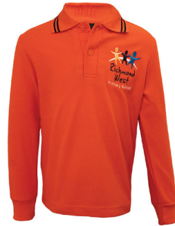
Polo Long Sleeve