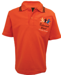
Polo Short Sleeve