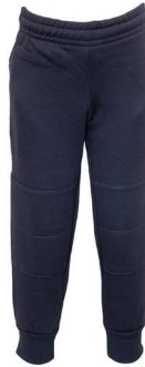
Trackpants Doubleknee Navy