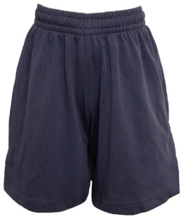
Shorts elastic waist Navy