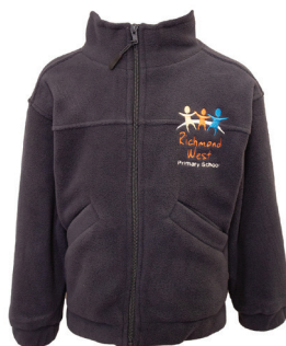
Polar Fleece Jacket