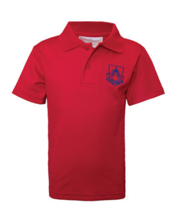
Sports Polo S/S