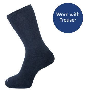
Sock Crew Navy 2pk