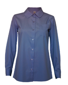
Peter Pan Blouse Lng Slv Blue