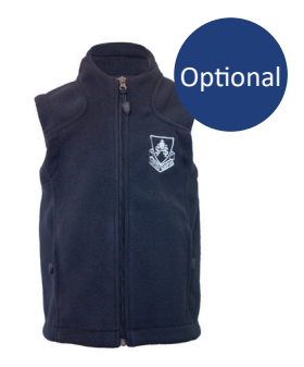
Polar Fleece Vest