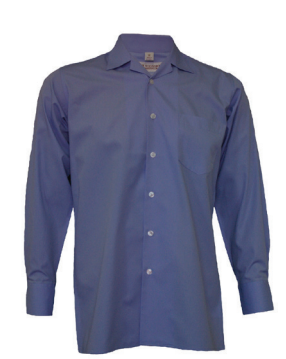
Shirt Open Neck Lng Slv Blue