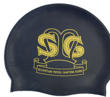
Swim Cap Squad