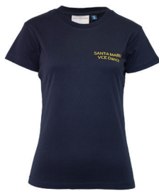
VCE Dance T-Shirt