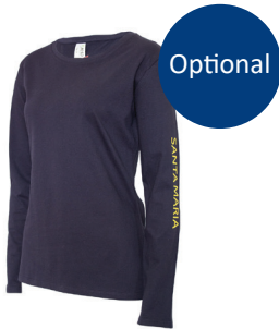
Sports T Long Sleeve