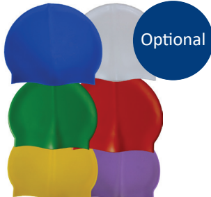
Swim Cap House