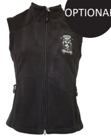
Polar Fleece Vest