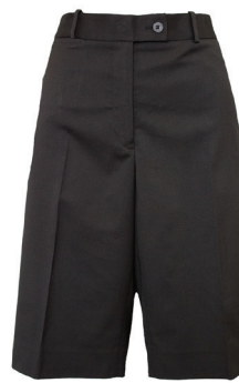
Shorts with Emb