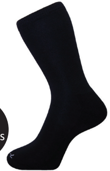
Socks Crew 3 pk