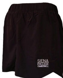
Sports Short with inner