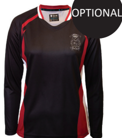
Sports Top L/S