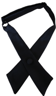
Cross Over Tie