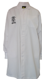
Lab Coat - Science

For current prices, please refer to www.bobstewart.com.au