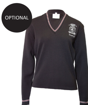
Year 12 Pullover