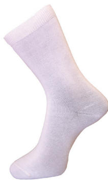
Socks Ankle 2pk