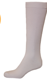
Socks Kneehigh 2 pkt