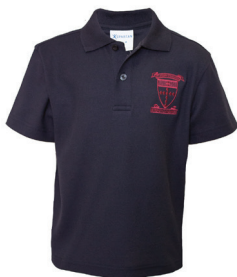
Polo Short Sleeve