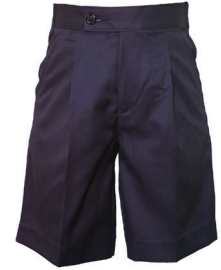
Shorts Primary Navy