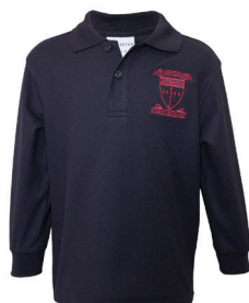
Polo Long Sleeve