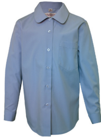
Blouse Peter Pan