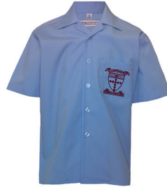
Shirt Short Sleeve