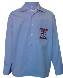
Shirt Long Sleeve