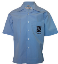
Shirt Short Sleeve