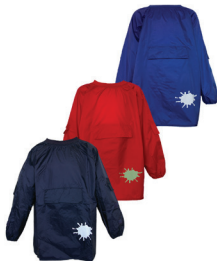
Art Smock - assorted colours

For current prices, please refer to www.bobstewart.com.au