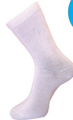
Socks White 2 pkt