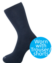
Socks Navy 3 Pkt