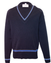
Pullover - Optional Navy