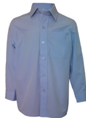
Shirt Long Sleeve