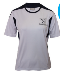
Interschool Sports Top