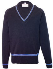
Pullover - Optional