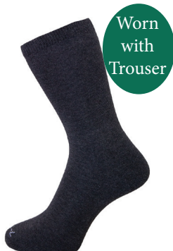
Grey Sock 3 pack