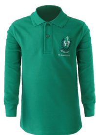
Polo Long Sleeve