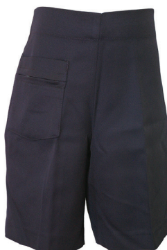
Shorts Pull On