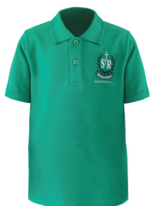
Polo Short Sleeve