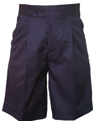
Shorts Fly Front