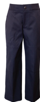
Trouser Double Knee