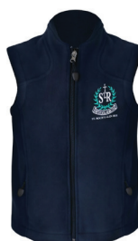
Polar Fleece Vest