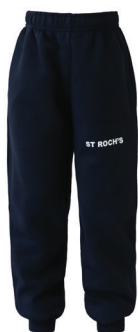
Trackpants Unisex Double Knee