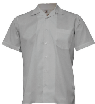
Shirt Open Neck Short Sleeve