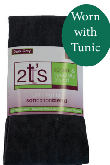
Dark Grey Tights