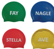
House Swim Cap