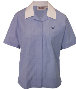
Short Sleeve Blouse