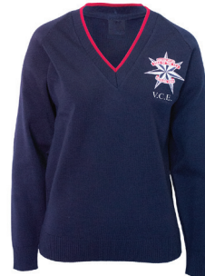
VCE Pullover Yr 11-12