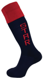
Winter Sport Sock