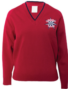
Pullover Yr7 - 10