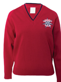
Pullover Yr7 - 10