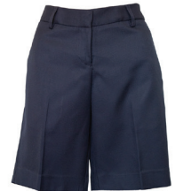
Tailored Shorts Navy