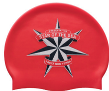
Squad Swim Cap