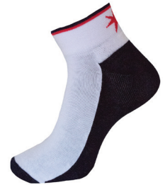
Sports Sock 2pk