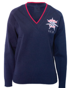
VCE Pullover Yr 11-12